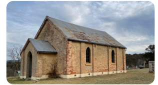
ST PETERS MUTTON FALLS 11:30AM 5TH SUNDAYS