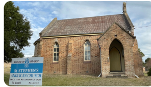
ST STEPHENS TARANA 11:00AM 2ND SUNDAY EACH MONTH