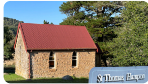
ST THOMAS' HAMPTON 11:00 AM 1ST & 3RD SUNDAY EACH MONTH